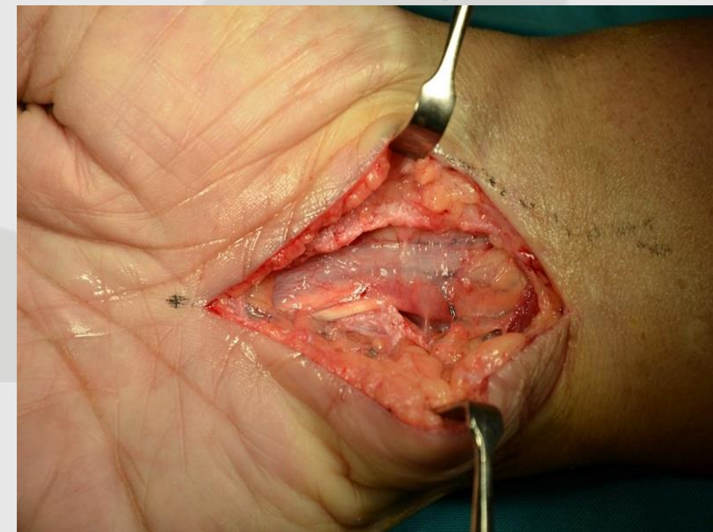
Live surgery cubital tunnel, ulnar nerve transposition, decompression, at the elbow [Online image]. (2012). Retrieved April 3, 2017 from https://www.youtube.com/watch?v=glncgsuHr68 and https://i.ytimg.com/vi/glncgsuHr68/maxresdefault.jpg